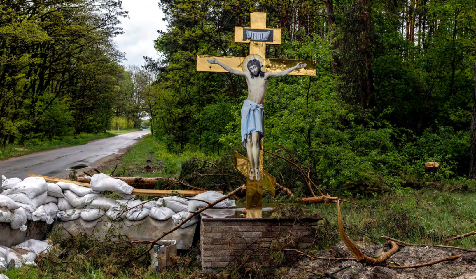
A crucifix marked with bullet holes stands at an abandoned Ukrainian Army checkpoint on the outskirts of Bohdanivka, northeast of Kyiv on May 18, 2022.