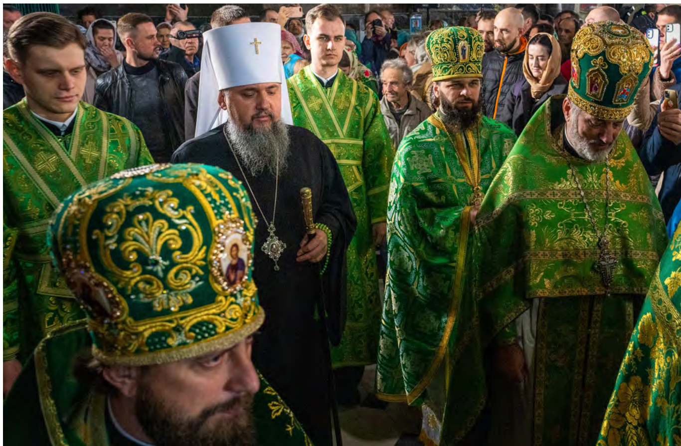
Metropolitan Epifaniy, primate of the Orthodox Church of Ukraine, center, conducts a Palm Sunday service at the Pechersk Lavra monastery in Kyiv on Sunday, April 9, 2023.

It is also important to note that intraparty peacebuilding activities do not always focus on achieving predetermined peacebuilding outcomes, as participants' aspirations and strategic visions for the future may be undefined. Interparty peacebuilding initiatives, on the other hand, often require special training for organizers, coordinators, and facilitators, as well as special security arrangements for dialogue participants due to the intense political sensitivities that may accompany such convenings. If the broader society does not feel ready for possible reconciliation, such activities can be premature and may pose a major threat to participants. They also may be endangered if they are perceived to transgress the boundaries of their communities through a willingness to meet with the enemy (especially in a wartime environment characterized by specific discourses of patriotism). At the same time, such interparty peacebuilders do not generally integrate into social groups on the opposite