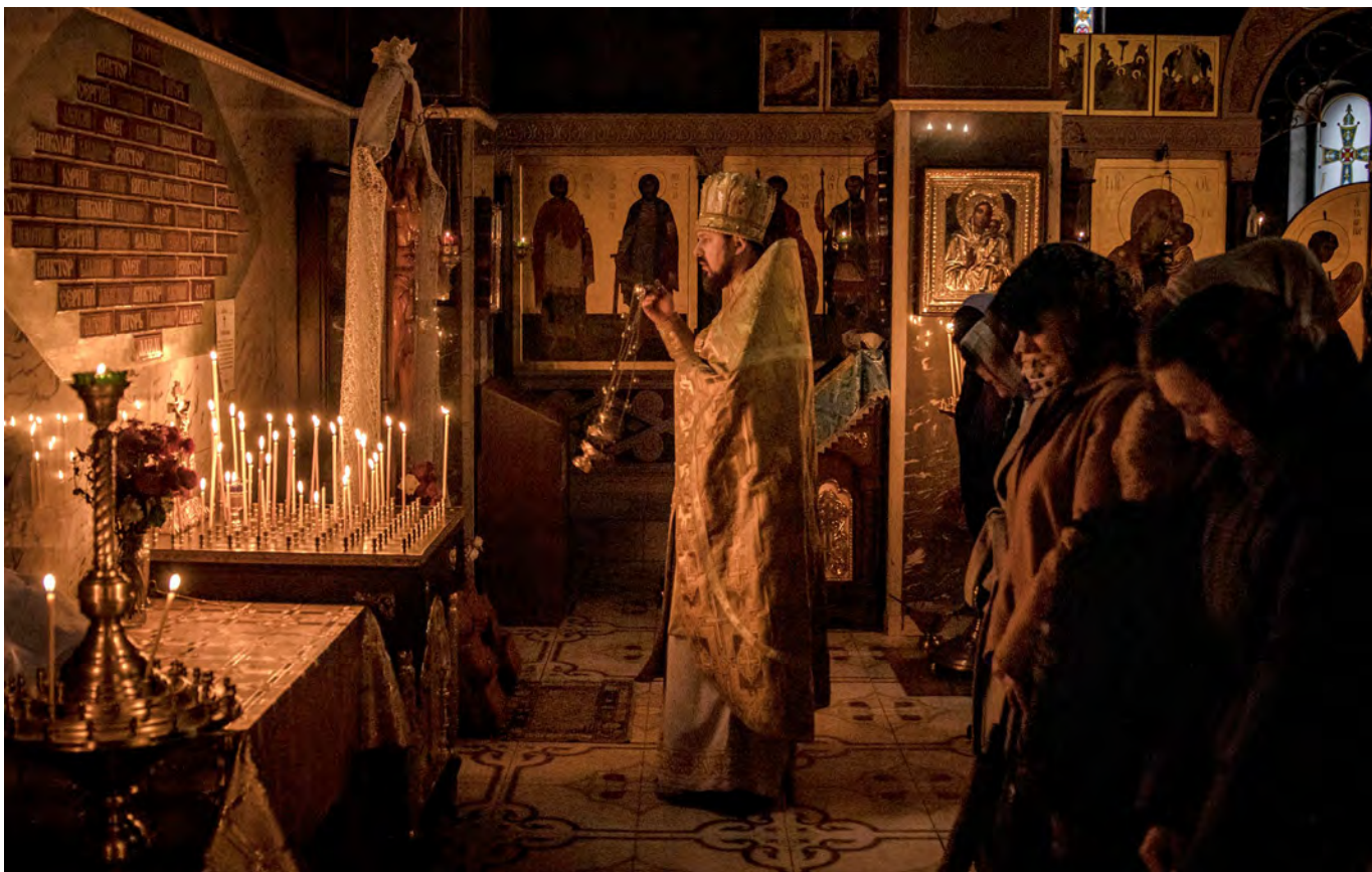
A priest leads a service at an Orthodox Church in Kryvyi Rih, Ukraine, on October 23, 2022. From a Russian perspective, Kyiv is often regarded as the birthplace of both the Russian nation and the Russian Orthodox Church.

war. Russia has long resisted the expansion of NATO into eastern Europe, considering this a threat to its security, but had been establishing deeper connections with the EU through a variety of economic partnerships. Resisting Western domination of the international system while also raising Russia's profile through economic integration became a difficult, but important, strategic balancing act. Ukraine, standing directly between Russia and Europe and increasingly leaning toward Europe, could easily have been considered a battleground that, at least ideologically, Russia was losing—particularly following the 2013–14 Euromaidan protests.